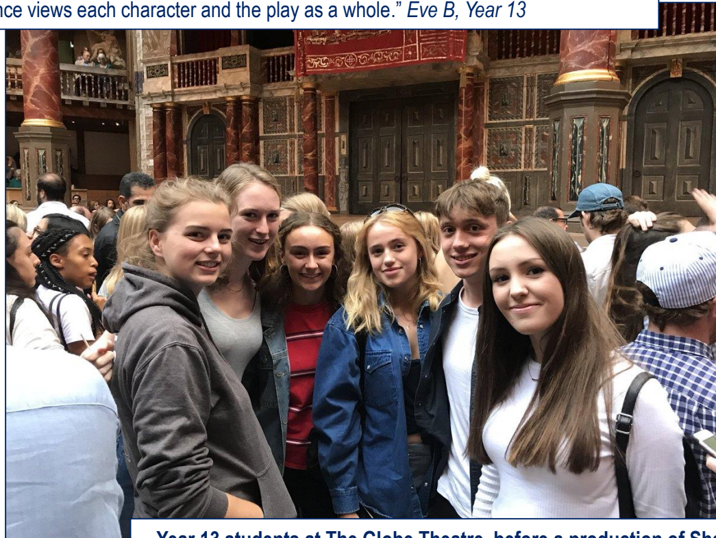
Year 13 students at The Globe Theatre, before a production of Shakespeare's Othello .