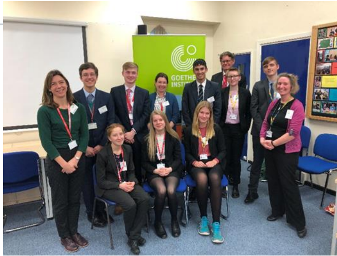
Y12 German students taking part in the German debating competition