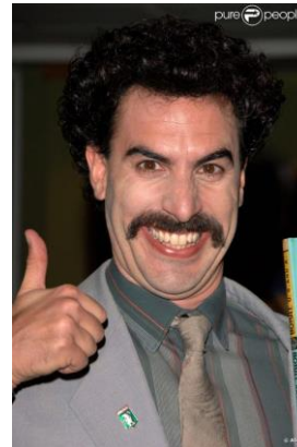
Sacha Baron-Cohen Cambridge University