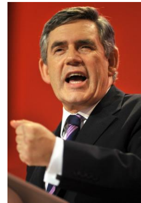
Gordon Brown Edinburgh University